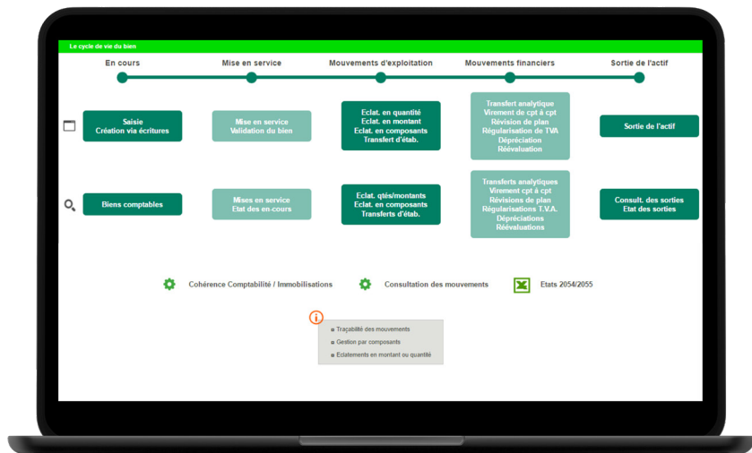
Ownership facilitated by users with customizable graphical processes.

For more information and to be put in touch with an expert: